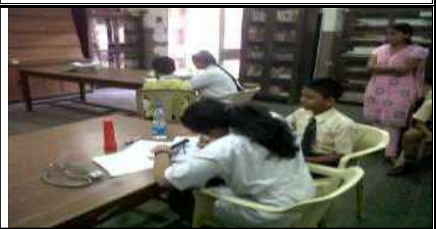
Students Mastering Important Life Skills Education (SMILE) Program- Conducted in BMC Schools for Underprivileged Adolescents.