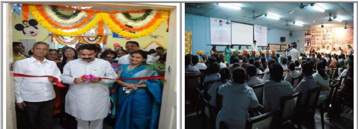
Hon'ble Mr. Ness Wadia, Director- Wadia Group Of Companies Inaugurating Play Room For Sanofi Pharmaceuticals At B. J. Wadia Children's Hospital.